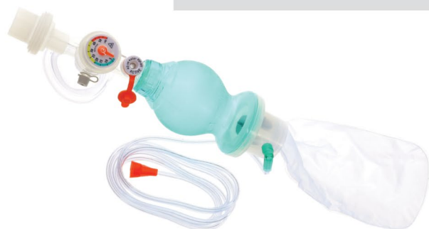
AirFlow bags come standard with mask

Shown with integrated pressure manometer, pop-off valve, non-inflatable mask, and inflatable O 2 reservoir