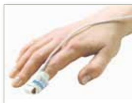
7000A Adult (> 30 kg / > 66 lbs)