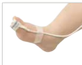
7000I Infant (2-20 kg / 2.2-44 lbs)