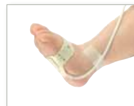
7000N Neonatal Neonate: (< 2 kg / < 4.4 lbs) Adult: (> 30 kg / > 66 lbs)

All sensors are packaged in 24-pack cartons. Use only with Nonin pulse oximetry.