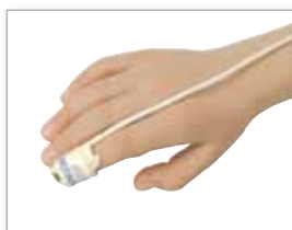
7000P Pediatric (> 10 kg / 22 lbs)